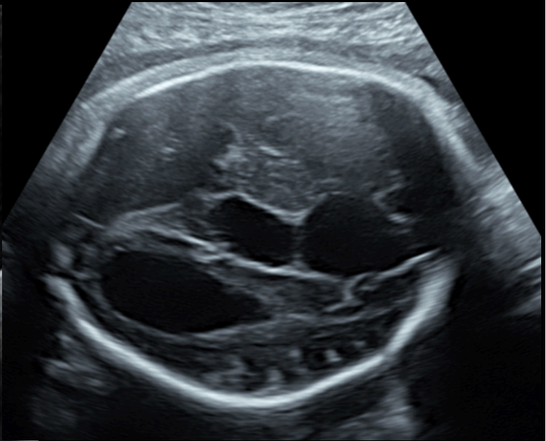
Obstetric US showing the asymmetric ventriculomegaly and an interhemispheric cyst.